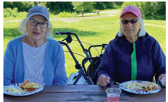
Photos above highlight just a few of the special moments captured during some of the group activities and celebrations we have shared at Woodbrook in recent months. Events include: (top) Arbor Day; (middle l-r) Kentucky Derby, Pie Face Game, Baby Goat Visit; (bottom l-r) Summer Kickoff Party and a Picnic at Sperr Park.