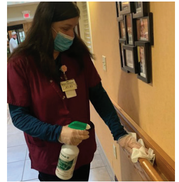
Housekeeping staff at Woodbrook follow rigorous daily protocols for sanitizing high traffic areas.

W ith the pandemic threatening the health and safety of our residents and staff, tough new cleanliness protocols were implemented under the direction of Dwayne Donaldson, Building and Ground Director. The housekeeping staff took extreme and proactive precautions to minimize infectious disease transmission, which have now become standard protocols for housekeeping. These steps included: